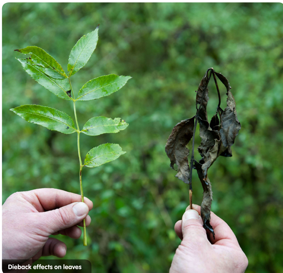
Dieback effects on leaves