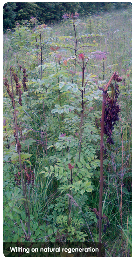
Wilting on natural regeneration

www.forestry.gov.uk/biosecurity-visitoradvice