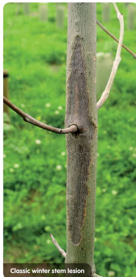
Classic winter stem lesion